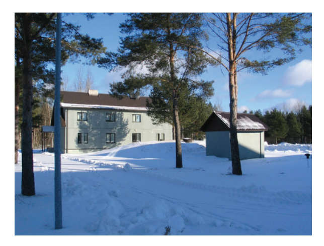
Illuka reception centre - winter

All asylum seekers are generally accommodated at the Illuka Reception Centre for Asylum Seekers. You are requested to spend nights (from 10. p.m. to 6 a.m.) at the Reception Centre.