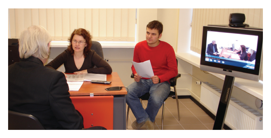
Interviewing room in the CMB

Each application is examined individually and all circumstances related to each specific application are taken into account when making a decision. Asylum proceedings are not public, which means that, if necessary, the relevant information may only be transferred to the authorities related to the proceedings and nobody else. In order to ensure your security and the confidentiality of the procedures the authorities involved in the processing of your application are forbidden to have any contact with the authorities of your country of origin.