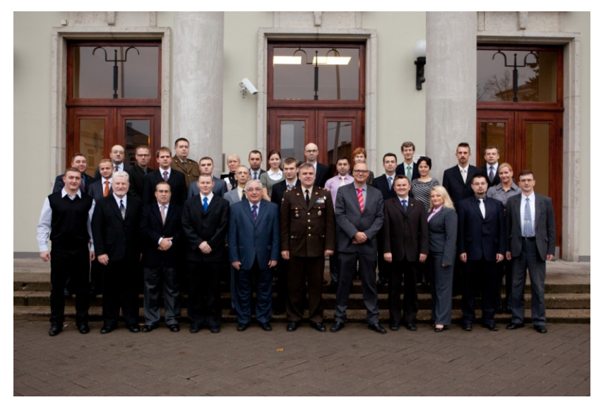
PfP ADL Seminar held at BDCOL

The Baltic Defence College is also a very active member in the Partnership for Peace (PfP) consortium and takes part in the PfP educational working groups. The Baltic Defence College also participates in the Central European forum for Military Education (CEFME).