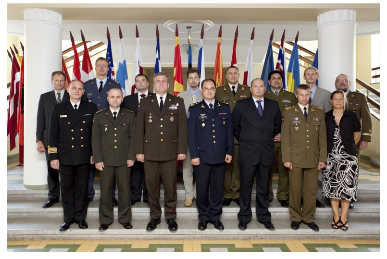
Higher Command Studies Course of 2010

Because of the strategic nature of the course, and the intention to deliver the curriculum at an appropriate level of expertise, the main source material for the HCSC is an extensive program of lectures from a range of distinguished guest lecturers. To ensure freedom of discussion, the College rule is that, unless otherwise stated, teaching takes place under the Chatham House Rule. The course also has a very high requirement for individual preparatory reading and studies. The students are required to write one essay and one individual research paper. During the residential part of the course five senior mentors and up to sixty speakers visited the College to provide teaching for the HCSC 2010.