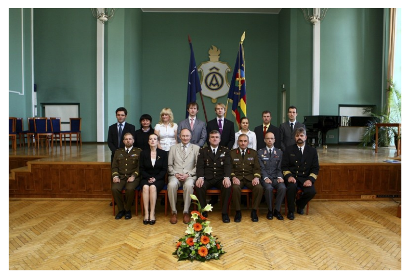
Civil Servants Course of 2010

The CSC 2010 was aimed "at addressing the needs of the national ministries and other governmental agencies, which are dealing with security issues, in order to prepare civil servants for the work in the international environment." A particular emphasis was "placed on building skills and knowledge necessary for contributing to the international operations, both at the strategic and operational levels".