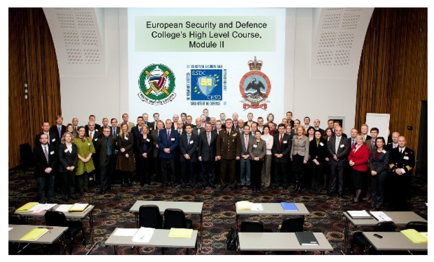
Participants of the ESDC High Level Course Module in Tartu 2010

Throughout, 2010 Baltic Defence College continued its presence on European Security and Defence College (ESDC) Executive Academic Board (EAB). Representative of BALTDEFCOL attended the ESDC EAB meetings in Helsinki and Brussels contributed to the development of ESDC curriculum, pedagogical improvement, and cooperation with partners.