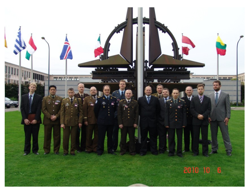
HCSC visit to NATO Headquarters

planning tools and techniques in order to recommend appropriate improvements to the force structures of the three Baltic States.