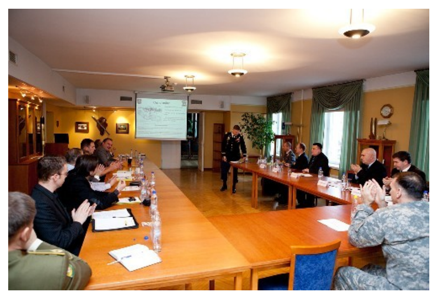
Baltic Military History Workshop

Baltic States in deploying forces abroad took place. In October there were two workshops, one on Baltic Region Military history that attracted academics from the Baltic States, Finland, Sweden, the US and UK and a second workshop on small states and strategy that took place as part of the Joint Course programme.