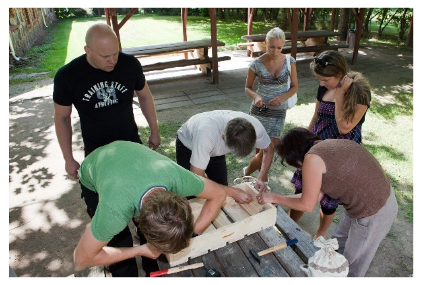
Members of the BDCOL staff during Team Building in 2010

academic backgrounds. In particular, a knowledge of NATO Comprehensive Planning (COPG) as well as experience gained in international operations or other international assignments is essential. In addition, the officers and civilian academics assigned to the BALTDEFCOL should be qualified and talented instructors.