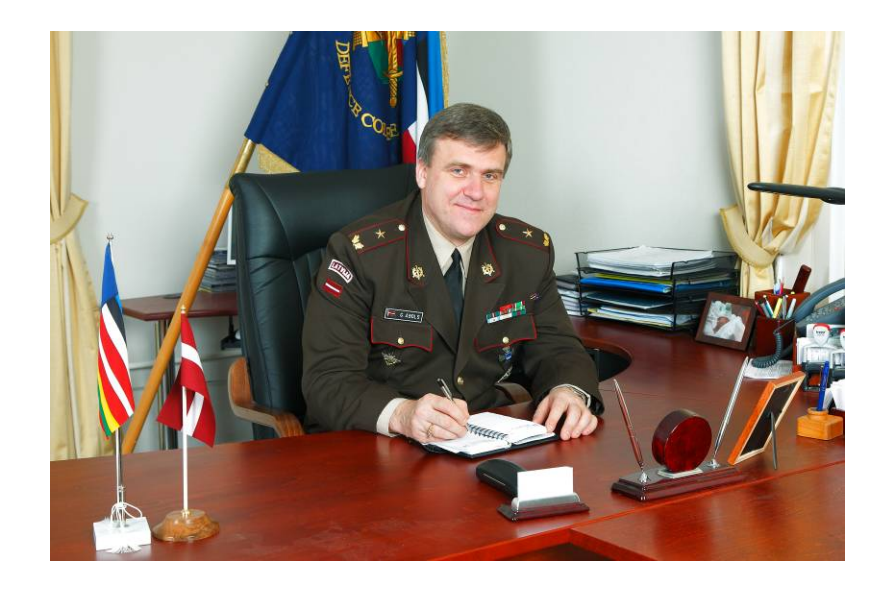
Brigadier General Gundars Ābols, Commandant of the Baltic Defence College

Despite the tough economic times that have directly impacted the budgets and armed forces of the Baltic States in 2009, the Baltic Defence College continues to make significant progress as a military educational institution. In 2009 the Baltic Defence College celebrated ten years as an institution and was honoured by a ceremony in Tartu in February by the presence of the presidents of the Baltic States. The presence of national leaders honouring the Baltic Defence College is proof that the College has reached a level of maturity as an institution.