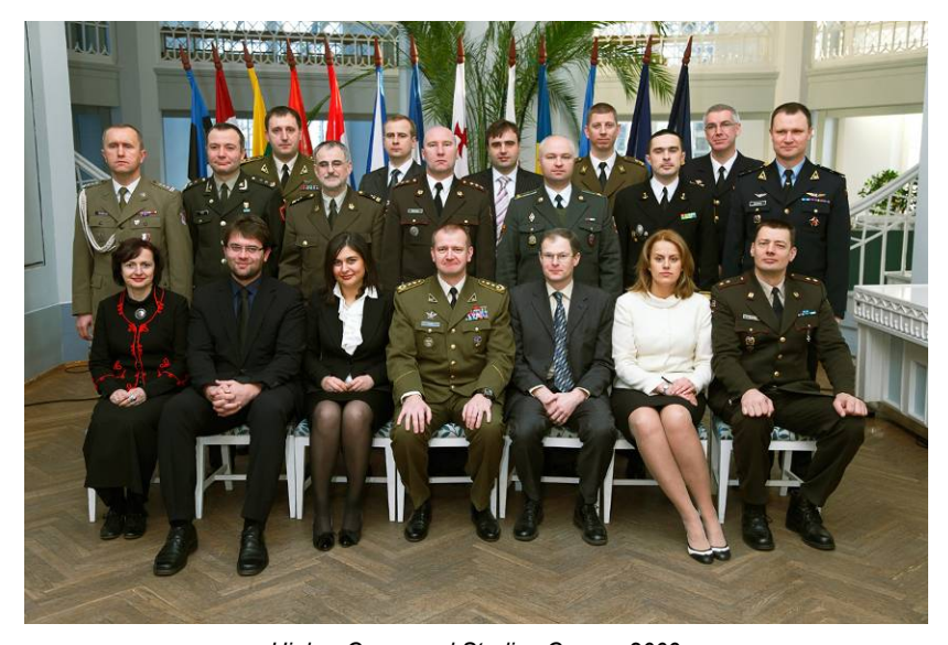
Higher Command Studies Course 2009

each working day in principle comprises five academic hours, and Friday three hours, for classroom activities, plus at least four further hours per day for self-study and preparatory reading.