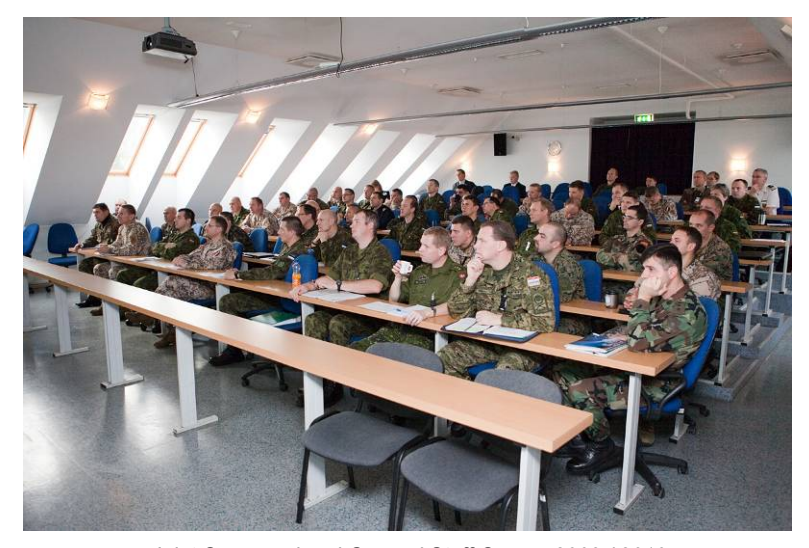
Joint Command and General Staff Course 2009 / 2010

erosion of the quality and readiness for land force Baltic officers entering the Joint Course.