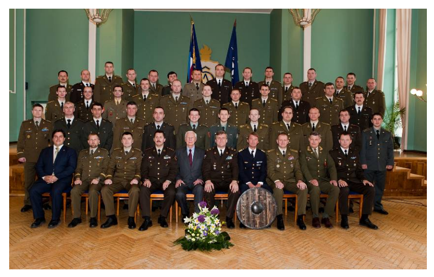
Army Intermediate Command and Staff Course 2009