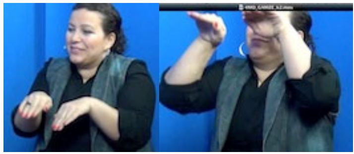
(...) CONSTRUCTED ACTION 'jump like this' (2 times)