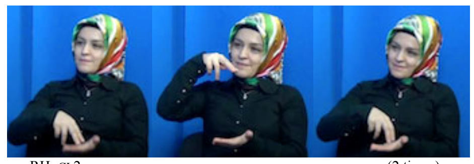
RH: CL2<sub>vertical_up_down</sub> (2 times)