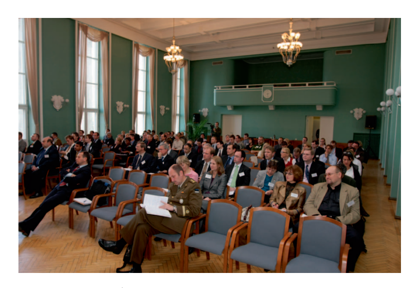
3<sup>rd</sup> Annual Baltic Conference on Defence (ABC/D)

conferences were also held at the BALTDEFCOL in 2006 and 2007 and focused on NATO's transformation as well as NATO's campaign in Afghanistan respectively.