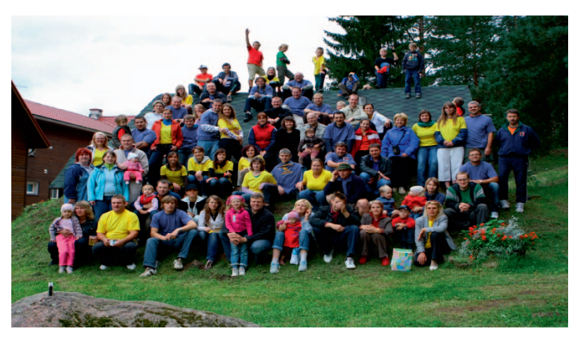
BALTDEFCOL staff with families during team building event in August 2008