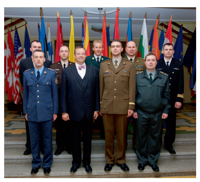
H. E. Mr Tomas Ilves with JCGSC students

Excellent - 13 students Good - 46 students Satisfactory - 5 students Not Satisfactory - 0 students