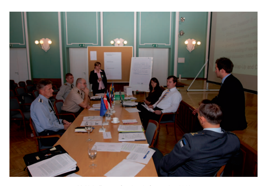
Multiple Futures Seminar in September 2008

Another event, the Multiple Futures Workshop, co-presented by the BALTDEFCOL and Allied Command Transformation on 23 September, was a great success. Forty-five participants from the three Baltic States, Canada, Denmark, Finland, France, Germany, Norway, Sweden, the United Kingdom, and the United States were on hand to consider four possible security scenarios for future up to the year 2030.