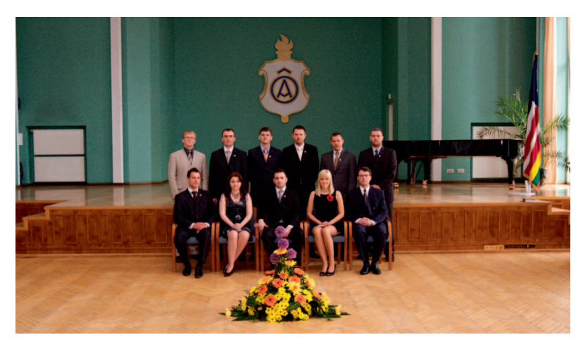
CSC 2008 graduation, June 2008

As the course is aimed at addressing the needs of the national ministries and other governmental agencies, which are dealing with security issues, students represented a very wide spectrum of institutions. There were representatives from ministries of Defence, Foreign Affairs, Interior and other agencies.