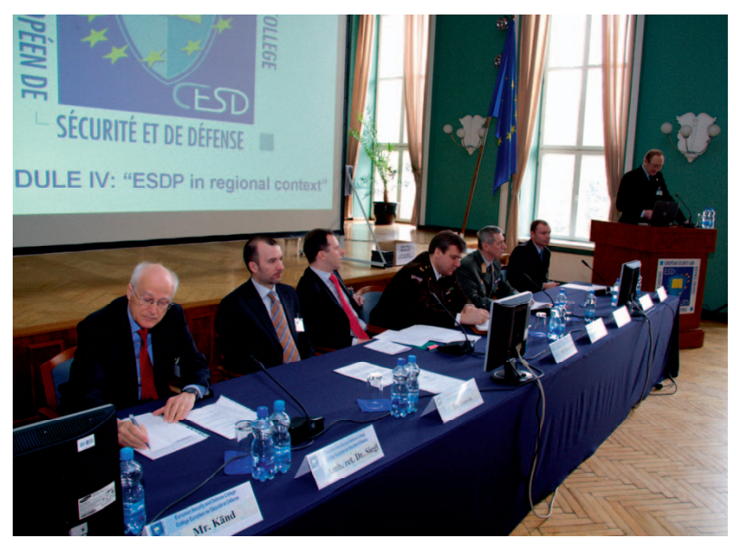
ESDC High Level Course "ESDP in regional context"

On 11-14 March, together with the Austrian National Defence Academy, BALTDEFCOL organized and delivered Module 4 of the European Security and Defence College's High Level Course. This activity attracted diplomats and senior EU civil servants to the College for the high-level portion of the course, entitled "ESDP in Regional Context". BALTDEFCOL was again invited to host a module of the ESDC in 2010.