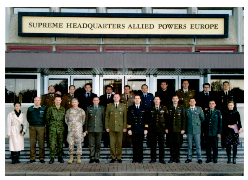
HCSC 2008 students and staff visiting SHAPE (Mons, Belgium) during the Field Study Trip

The first study trip to strategic level NATO/EU HQs was combined with a visit to Kiev where the course met with the representatives from the NATO Liaison Office, the Ministry of Defence, the General Staff, the Ministry of Foreign Affairs, and the Security and Defence Council. In Brussels and Mons, the students were able to analyse transformation programmes and discuss major policy issues with representatives from NATO IS and IMS, SHAPE, EUMS, ACT cell at SHAPE, EDA, the Office of EU High representative for Common Foreign and Security Policy, the three Baltic states' Permanent and Military Representatives to NATO and the EU and the Belgium MoD. During the other trip to Riga, Vilnius and Tallinn, the students were addressed by representatives from the Parliaments, Ministries of Foreign Affairs and Defence and Defence Staffs, and were able to gather the facts necessary to support the Force Planning Exercise.