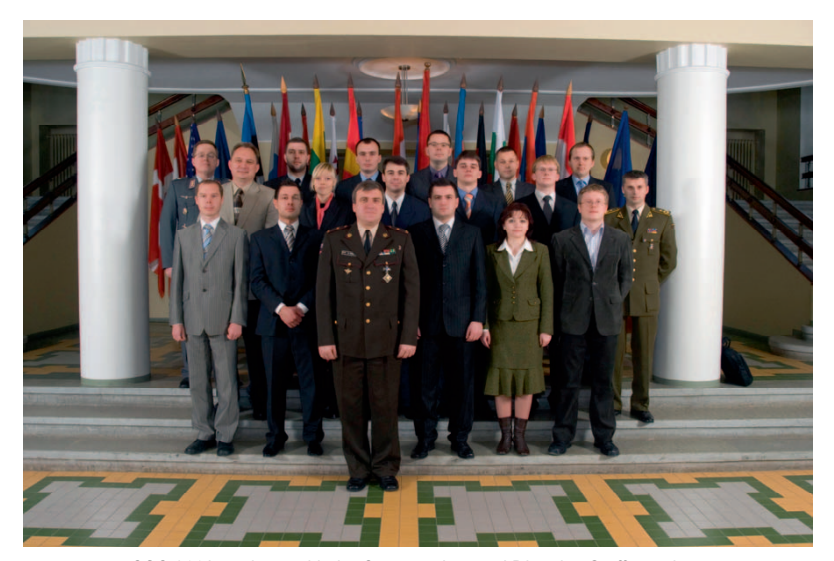
CSC 2008 students with the Commandant and Directing Staff members