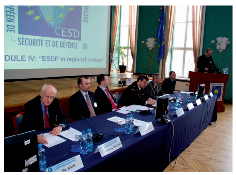
ESDC High Level Course "ESDP in regional context"

BALTDEFCOL hosted and conducted several important activities during year 2008. On 10-14 March Module IV (ESDP in Regional Context) of the European Security and Defence College (ESDC) High Level Course was held at the BALTDEFCOL. The Module was co-organized by BALTDEFCOL, the Austrian National Defence Academy, and authorities of Estonia, Latvia and Lithuania. ESDC HLC Module IV focused on the regions which are of special concern to security in Europe: the Balkans, Eastern Neighborhood of the EU, the Middle East and South Asia.