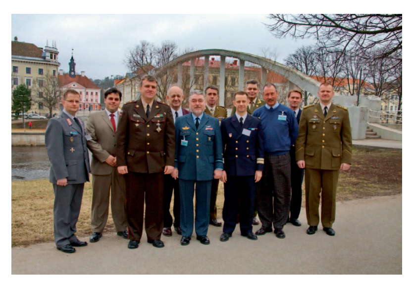
Participants in the EBAO seminar, March 2008

On 12-13 March a seminar on Effects Based Approach to Operations was held in the premise of the BALTDEFCOL. The key objective of the conference was to explore the challenges of implementing the EBAO as it is accepted by NATO, European and Coalition forces, to enhance knowledge and understanding. The seminar not only focused on how EBAO is applied in major military operations taking place today, but also the civilian applications and on how to possibly apply the EBAO concept in the whole spectrum of operations, from Counter-Insurgency and Peace Support to Humanitarian Relief operations.