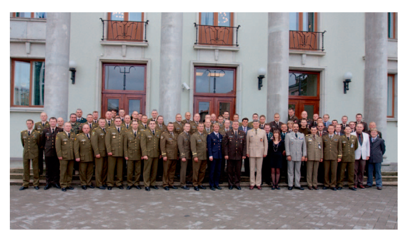
Army Intermediate Command and Staff Course students and staff members August 2008