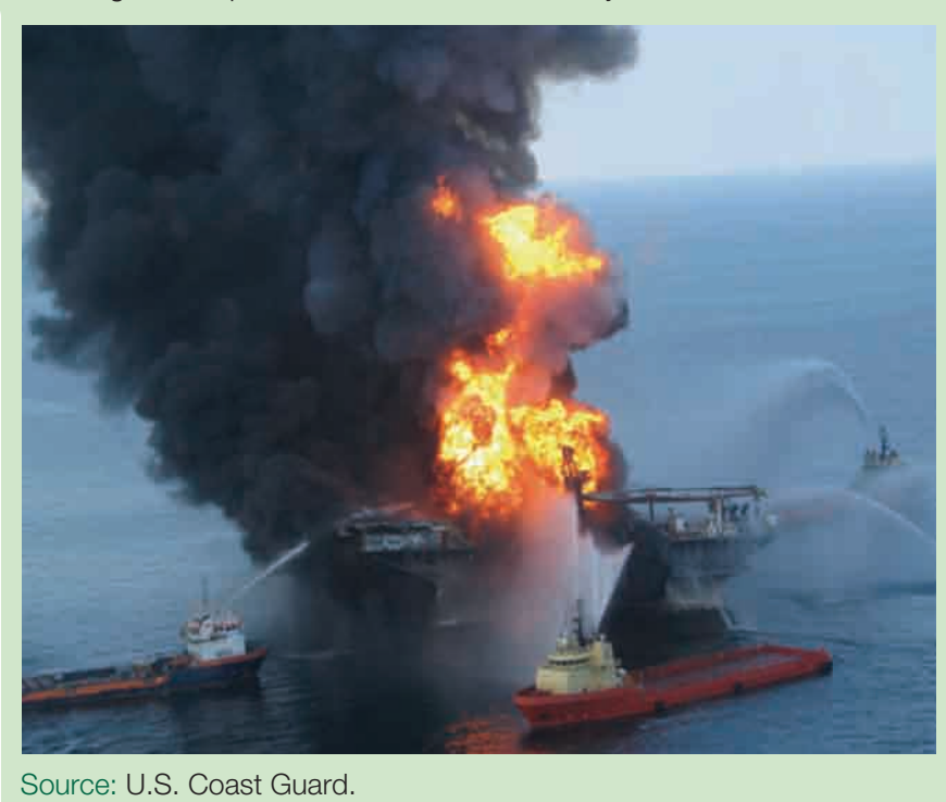
Figure 6: The Explosion of the Deepwater Horizon Drilling Unit in the Gulf of Mexico in 2010 Resulted in the Largest Oil Spill in the United States' History and Produced Severe Environmental Consequences

Pollution in the marine environment generally comes from two sources. First, most river systems eventually drain into oceans or seas, and in doing so deposit the pollution they have accumulated over the course of their journey over land into the marine environment. Second, oil spills and the release of other types of pollution from ships sailing at sea can be another important cause of marine pollution (see fig. 6). Coastal zones are considered to be at particular risk from pollution in the marine environment. Notably, marine pollution can lead to significant destruction of coastal ecosystems and habitats, which subsequently affects humans who rely on these ecosystems for their livelihoods and can cause human health problems (e.g., due to contaminated shellfish). <sup>26</sup> Similarly, pollution in the marine environment has also contributed to toxic algal blooms and oxygendepleted 'dead zones' that harm marine life and threaten biodiversity and fisheries.