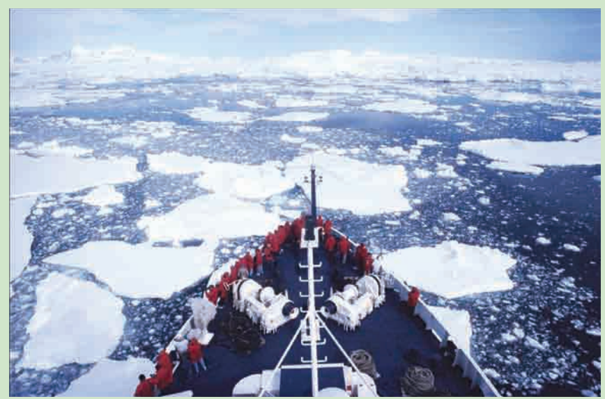
Figure 11: Increased Glacial Melting Due to Climate Change is Expected to Contribute to Future Sea Level Rise

• Sea level rise. The anticipated rise in global sea levels is forecasted to produce a variety of harmful impacts, including increased coastal flooding risks and greater salinisation of groundwater and estuaries, which will decrease the quality and quantity of freshwater available for humans and ecosystems (see fig. 11).