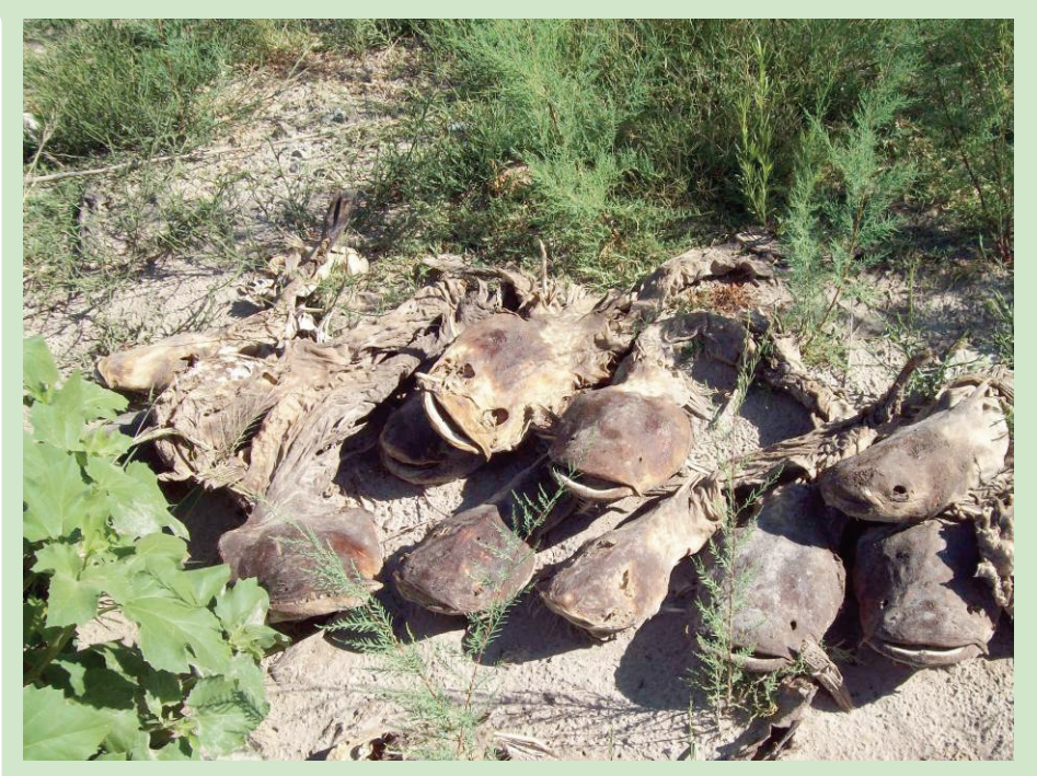
Figure 3: Dead Fish from a Lake in Texas in the United States that Recently Experienced Severe Drought

Many countries are already affected by serious drought conditions during many months of the year. Projected increases in temperature and decreases in precipitation associated with climate change, compounded by early snowmelt, are expected to exacerbate the problem in many parts of the world. Severe droughts have been shown to produce wide ranging negative impacts, including economic (e.g., reduced agricultural production), social (e.g., increased stress on farming families and rural communities), and environmental (e.g., damage to wetlands and other important ecosystems from reduced water flows) harm (see fig. 3). A study by the International Water Management Institute found that countries with largely agricultural economies are generally more vulnerable to the adverse impacts of drought than countries with more diversified economies. In particular, the more complex economies of developed countries are typically better positioned to insulate their populations from fluctuations in agricultural productivity due to drought compared to the more agrarian economies of many developing nations.<sup>13</sup>