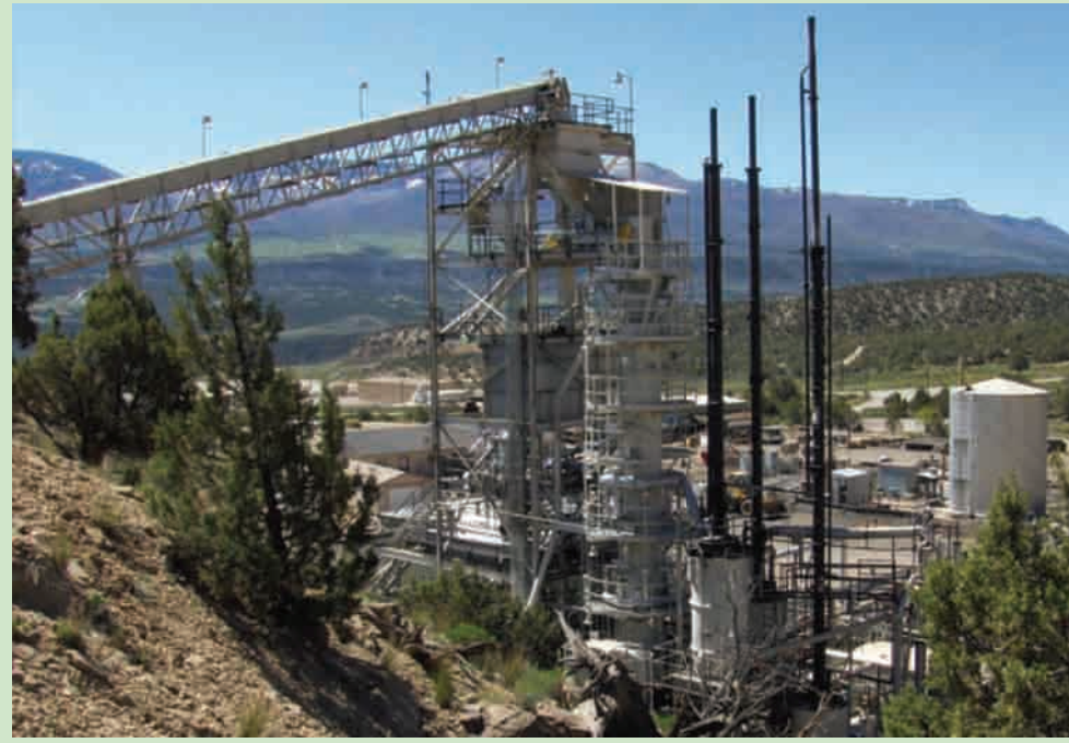
Figure 2: Diverting Water for Oil Shale Development (Such as this Surface Retort in Colorado) Could Limit the Amount of Water Available for Agricultural and Urban Development in Parts of the United States