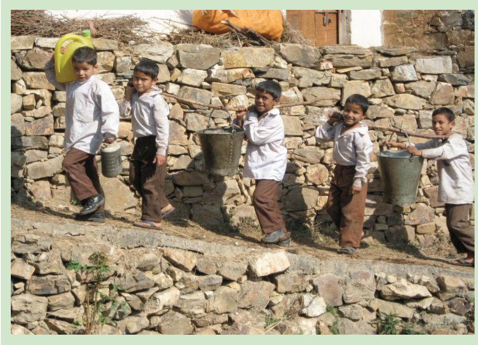
Figure 1: Millions of People Around the World—Such as these School Children in India—Lack Easy Access to Safe and Secure Drinking Water Supplies

Source: Comptroller and Auditor General of India 6