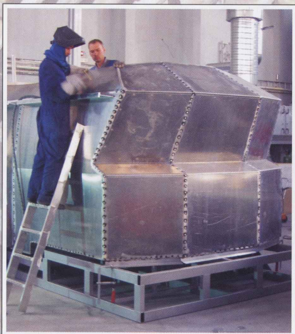
Steering house under construction for 14 m fast combat boat