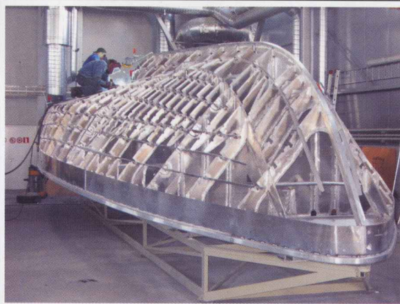
15 m pilot boats hull construction

Currently, there are four 15 m aluminium ice-going pilot boats and four 5 m SAR boats under construction for Marine Alutech OY, a Finnish company. In addition to that, various hull constructions of aluminium such as wheelhouses are built under subcontracts.