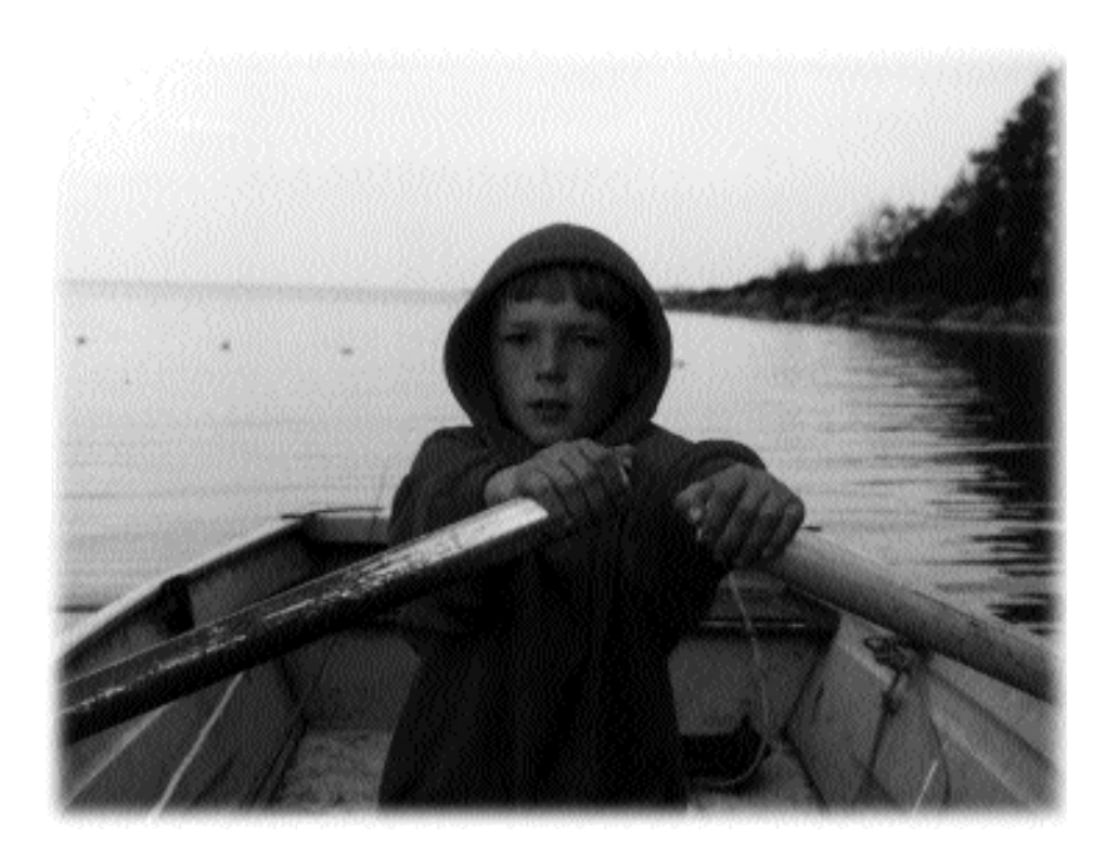
Peipsi – Чудское The lake which unites Estonia and Russia

Center for Transboundary Cooperation and Sustainable Development