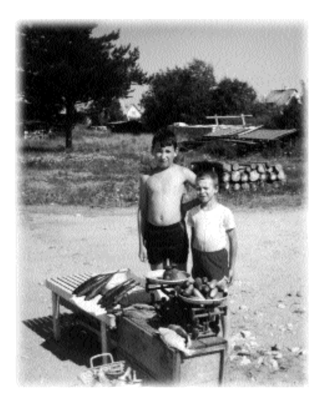
Local children in local economy