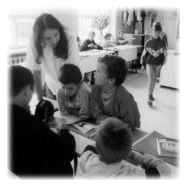
Developing communication skills was one of the main goals of the project.

In 1997, 100 children ages 9 to 17 years came from Narva to stay with Estonian families in Mustvee for two weeks. During the summer of 1998, 180 children from Narva studied Estonian language and culture in Mustvee and Räpina.