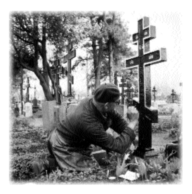
Common borders - common culture and traditions.

promote development of a shared vision of the Narva River Basin Sustainable Development among all program participants and a better understanding and closer cooperation between experts working in different fields (geologists, hydrologists, economists, lawyers, etc.). The Narva River Basin Management Research Program is still at its very initial organizational stage, however, we hope that in the long run it will become an important basis for the further work on the development of the Narva River and Lake Peipsi/Chudskoe Basin Management Plan and formulation of concrete environmental protection measures aimed at development of an environment for sustainable human development.