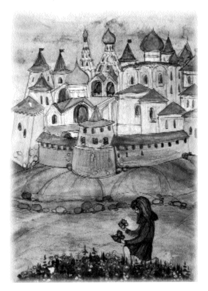
Olga Bolshakova (14), "Memories of Pskov" from "World of Water Through the Eyes of Children" art contest

The Social Issues Forum linked economic, environmental and social problems. The recommendations worked out during the forum formed the basis for creation of a sustainable development plan for Tartu Agenda 21.