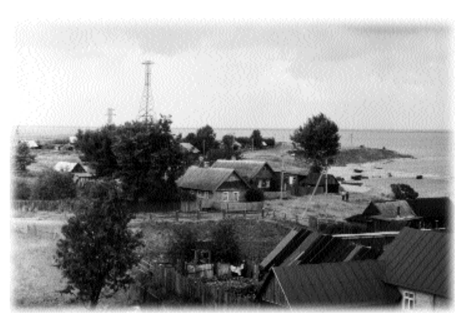
View of Mustvee

Pólva County Government Tartu County government Pskov Town Pskov Regional Governments Tartu Town Government Mustvee, Kallaste and Räpina Towns Nature Studies and Environmental Education Center of Daugavpils Pedagogical University North Vidzeme Regional Development Fund