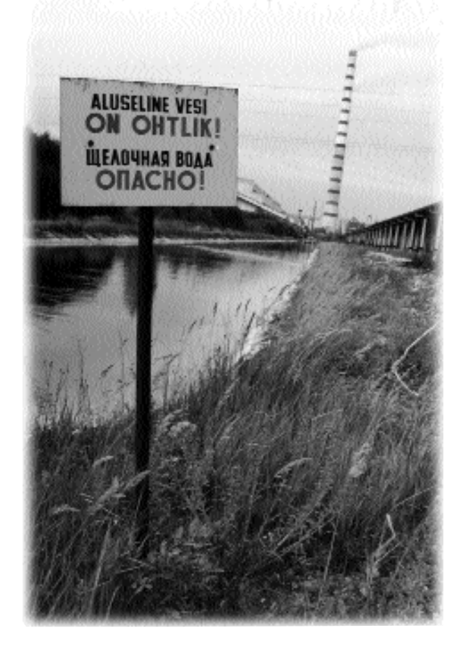
North-East Estonia is a highly polluted area. "Danger. Basic water", says the sign.

The publication of the 'NARVA DIGEST' is also intended to help Russian-speaking people in Narva feel more connected to Estonia and assist with the integration of non-Estonians into Estonian society.