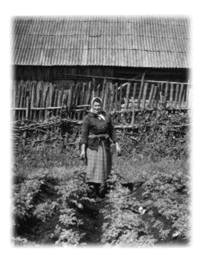
Vegetable growing on Lake Peipsi shores has been popular for centuries

The participants at Narva Forum developed suggestions for specific joint social, environmental and economic projects. Approximately 20 joint projects and initiatives were formed during the time of the discussions within the framework of the conference.